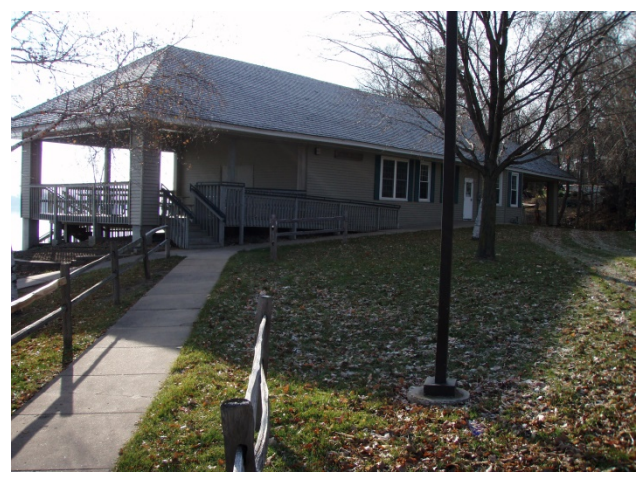
View from Parking lot