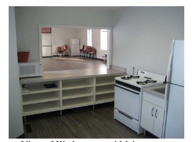
View of Kitchen toward Main room