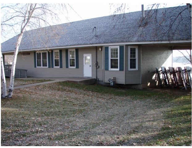
Street view toward Parking lot