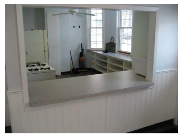
View of Kitchen from Main room