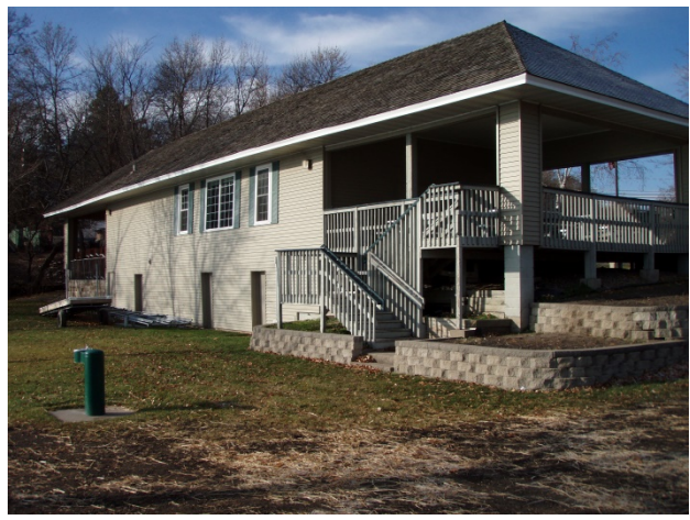
View from Lake side