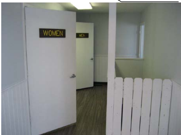
Hall, Stairs, and Restrooms