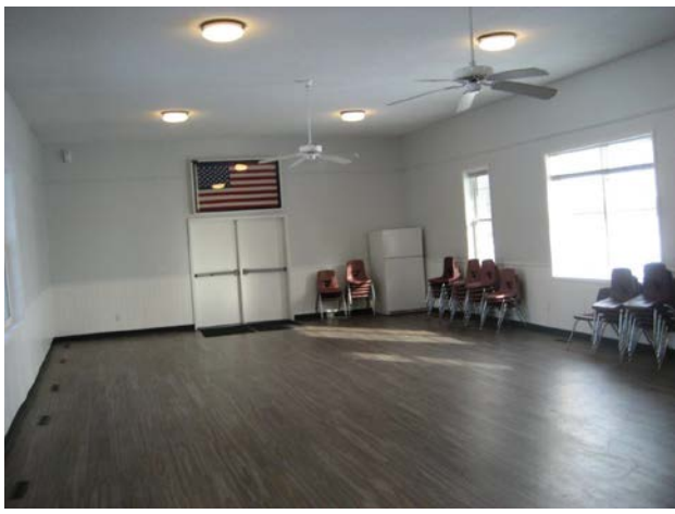
View from Kitchen to end of Main room