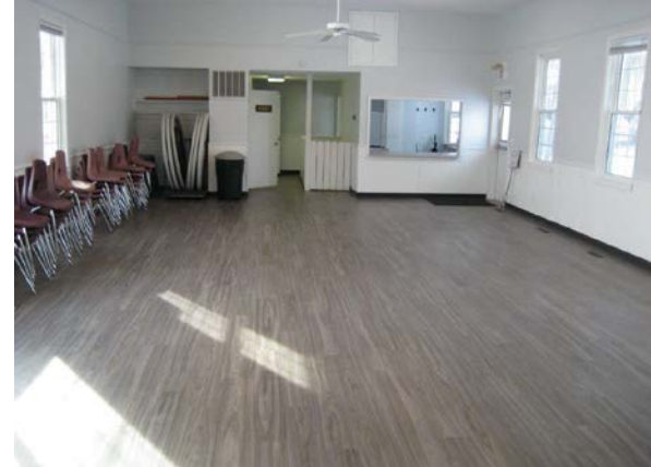
View toward Kitchen of Main room